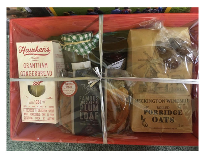
Above : One of over 40 hampers delivered to Heritage Lincolnshire.

We have traditionally held our AGM in June, and of course last year meant we had to do a very curtailed Zoom event in September. The plan for 2021 is to again aim for the Autumn but hoping able to meet again in person. Look out for more details in our Autumn newsletter