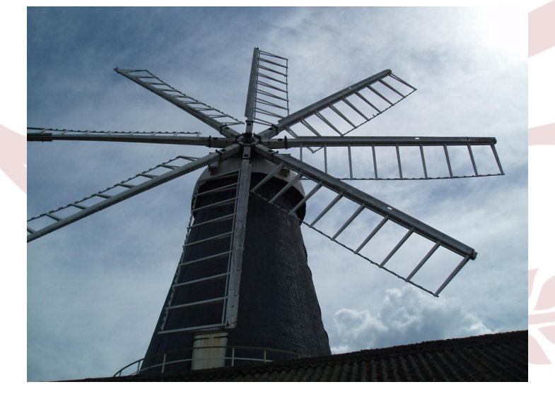
Above : Mill with shutters removed in preparation for repair