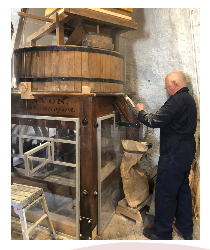
Above : Milling on the Hurst frame during lockdown

We can't wait to see our beautiful mill working again