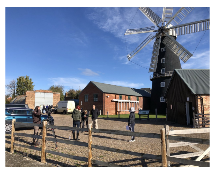
Above : Filming in the summer of 2020 for Antiques Road Trip.

Look out for us in the 5<sup>th</sup> and final episode of the next series, due to air later in the year. The windmill continues to attract TV crews from all over the country – indeed we already have an enquiry for a booking for next year – watch this space for more details!